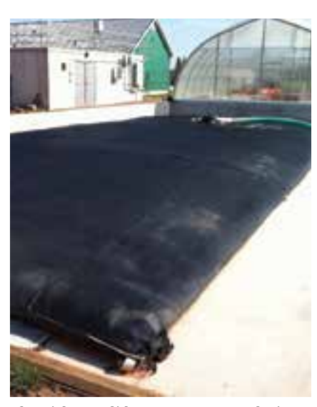
The Bishop Solids Management Solution has enabled North Rustcio WWTF to become self-sufficient for sludge handling and save tens of thousands of dollars annually in operating costs.

One additional Geotube® container can be set up in a greenhouse during the winter months, enabling sludge to be pumped and dewatered year round.